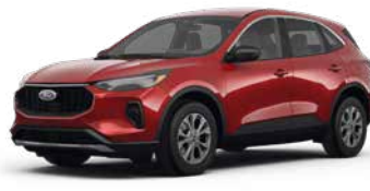
2024 Ford Escape Active AWD SK#R-378 ADV