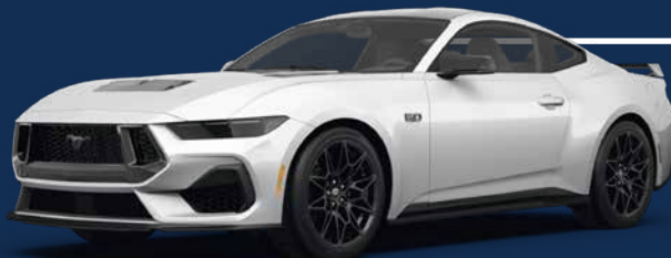
2024 Ford Mustang GT Coupe Premium SK#R-018 ADV

LEASE FOR $389 BW(1) OR CASH PRICE $66,273 @4.99% over 48 months OAC with $1,000 towards Woodridge Flex Plan Lease price $68,273