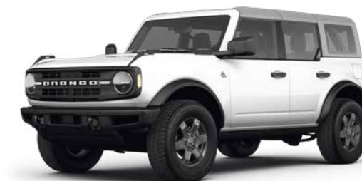
2023 Ford Bronco Outer Banks SK#P-1313 ADV

@4.99% over 48 months OAC with $1,500 towards Woodridge Flex Plan. Lease price $70,689