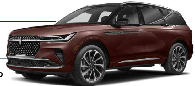
2024 Lincoln Aviator SK#R-969

@4.49% over 48 months OAC with $2,000 Down. Lease price $65,820