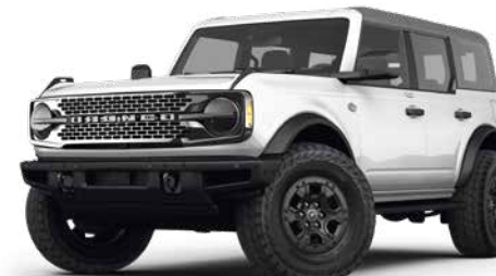
2023 Ford Bronco Black Diamond SK#P-2130

@2.99% over 60 months OAC with $500 towards Woodridge Flex Plan. Lease price $44,981