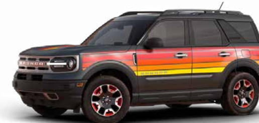
2024 Ford Bronco Sport Free Wheeling SK#R-739

@2.99% over 60 months OAC with $500 towards Woodridge Flex Plan. Lease price $40,781