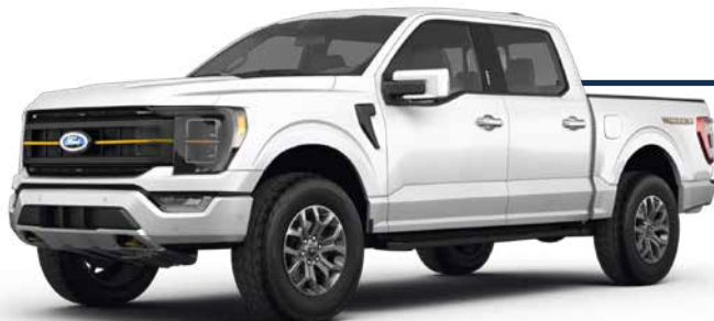
2023 F 150 Tremor Crew Cab SK#P-2198

ACT FAST TO GET HUGE DISCOUNTS ON ALL REMAINING IN-STOCK 2023 F 150 MODELS!