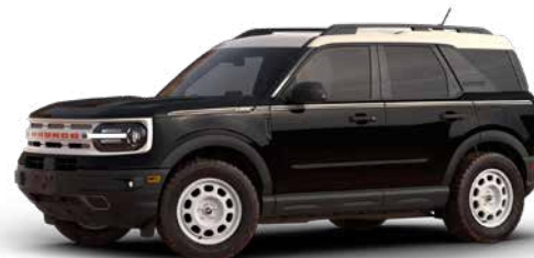
2024 Ford Bronco Heritage SK#R-734

@2.99% over 84 months OAC with $500 towards Woodridge Flex Plan. Finance price $48,279