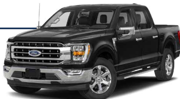
2024 F 150 STX Crew Cab SK#R-230 ADV

@2.99% over 48 months OAC with $1,500 towards Woodridge Flex Plan. Lease price $77,598