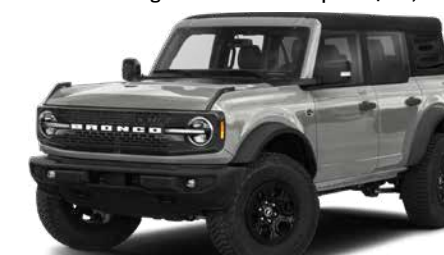
2023 Ford Bronco Wildtrak SK#P-2133

@4.89% over 48 months OAC with $1,500 towards Woodridge Flex Plan. Lease price $72,219