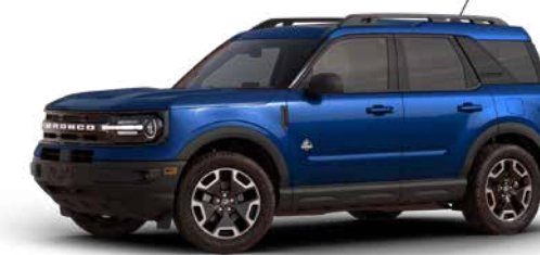
2024 Ford Bronco Sport OuterBanks SK#R-826

@2.99% over 60 months OAC with $500 towards Woodridge Flex Plan. Lease price $47,226