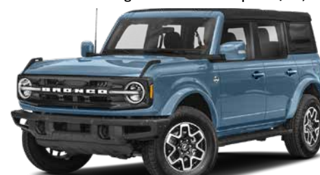
2023 Ford Bronco Badlands SK#P-2060

@4.99% over 48 months OAC with $1,500 towards Woodridge Flex Plan. Lease price $64,763