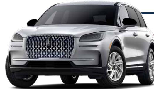
2024 Lincoln Corsair SK#R-535

LEASE FOR $299 BW(1) OR CASH OR LEASE PRICE $57,071