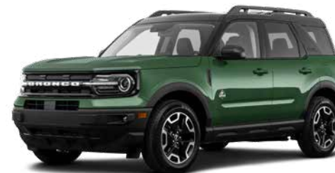
2024 Ford Bronco Sport Big Bend SK#R-370 ADV

LEASE FOR $195 BW(1) OR CASH PRICE $36,781